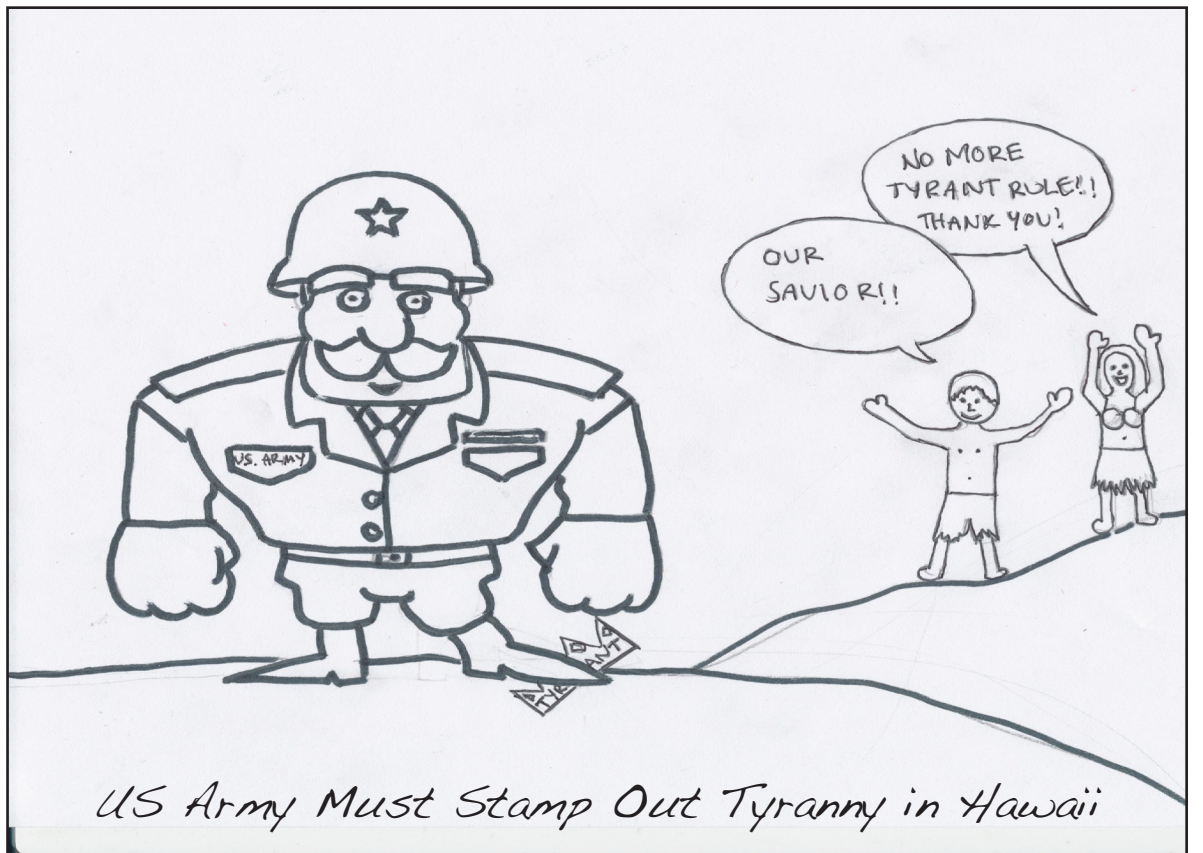
US Army Must Stamp Out Tyranny in Hawaii

In a statement, President Grover Cleveland said that the United States would not condone the queen's constitution. "The constitution has the potential to devastate the sugar trade of the United States, and take measures if necessary."