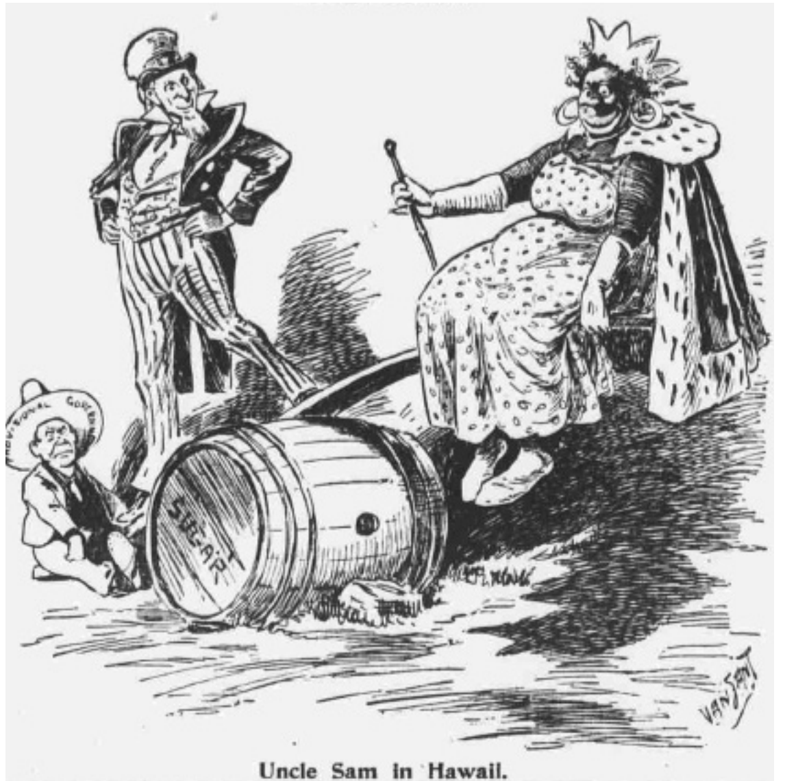
Uncle Sam in Hawaii.